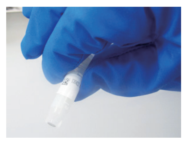
Figure 3. Cryo tube with 2D barcode. Each sample is printed with a unique barcode and is managed using a database.