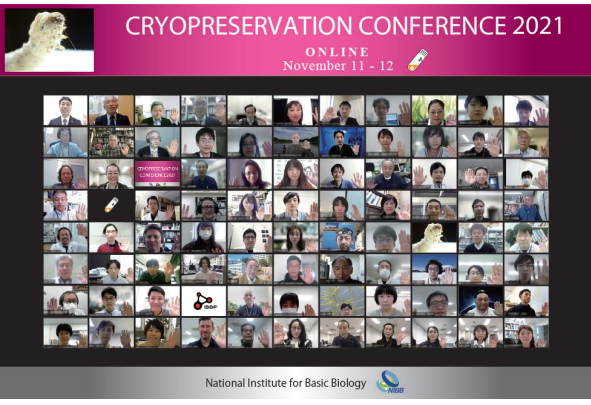
Figure 4. Group photo of Cryopreservation conference 2021

As the IBBP Center can only accept biological resources which can be cryopreserved in liquid nitrogen, researchers cannot backup biological resources for which cryopreservation methods are not well established. In order to increase the usability of IBBP, we started a collaborative research project for the development of new long-term storage technologies and cryo-biological study in 2013. This collaborative research focuses on two goals: 1) The establishment of new storage technologies for biological resources for which long-term storage is unavailable. 2) Basic cryobiological research enabling us to improve low temperature storage for biological resources. In 2021, we have conducted 10 collaborative research projects aimed at achieving these goals. We also worked to establish a research center for cryo-biological study thorough this Collaborative Research Project. Accordingly, we organized the Cryopreservation Conference 2021 on November 11-12, 2021 online, because of the COVID-19 pandemic. We had 227 participants from several fields covering physics, chemistry, biology, and technology. As the special lectures, We had 4 special lectures, the current status of the preservation of cultured cells and germ cells of endangered species at the National Institute for Environmental Studies, the relationship between protein conformational changes and additive properties that occur