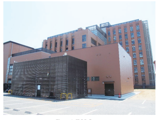
Figure 1. IBBP Center.

The IBBP Center was established as a centralized backup and storage facility at NIBB, while IBBP member universities have set up satellite hubs and work closely with the IBBP center to put in place reciprocal systems for backing up important biological resources that have been developed by researchers residing in the area each university satellite hub is responsible for.