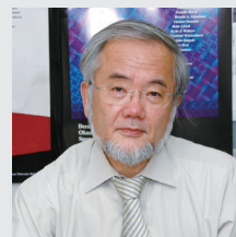
Professor Emeritus OHSUMI, Yoshinori