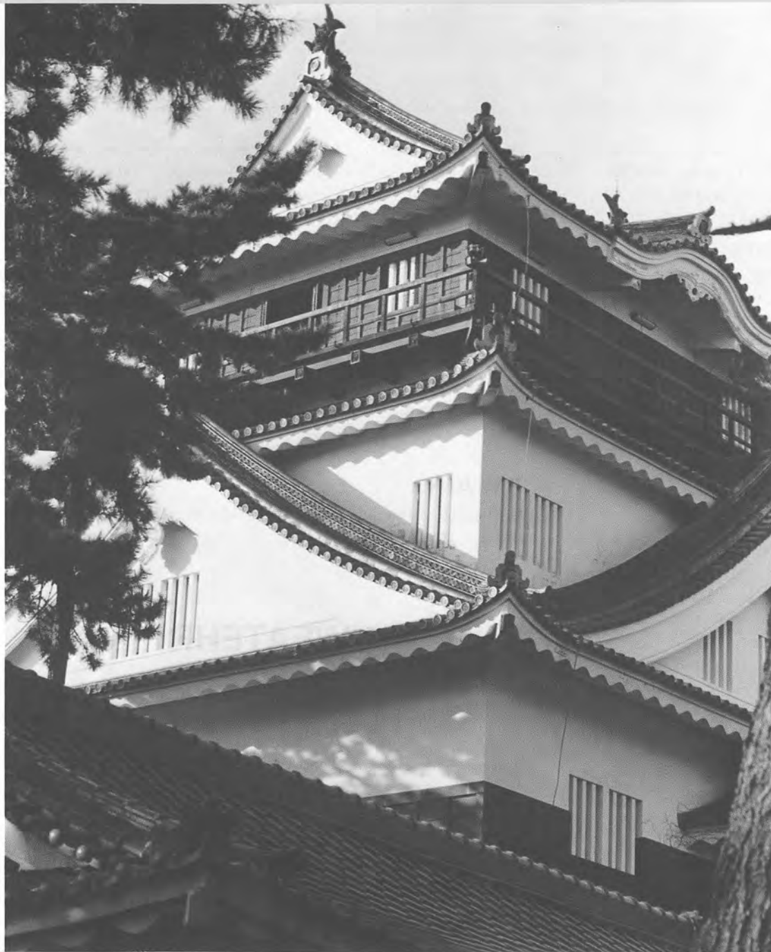
THE OKAZAKI CASTLE, THE HOME OF THE FIRST TOKUGAWA SHOGUN, IYEFASU.