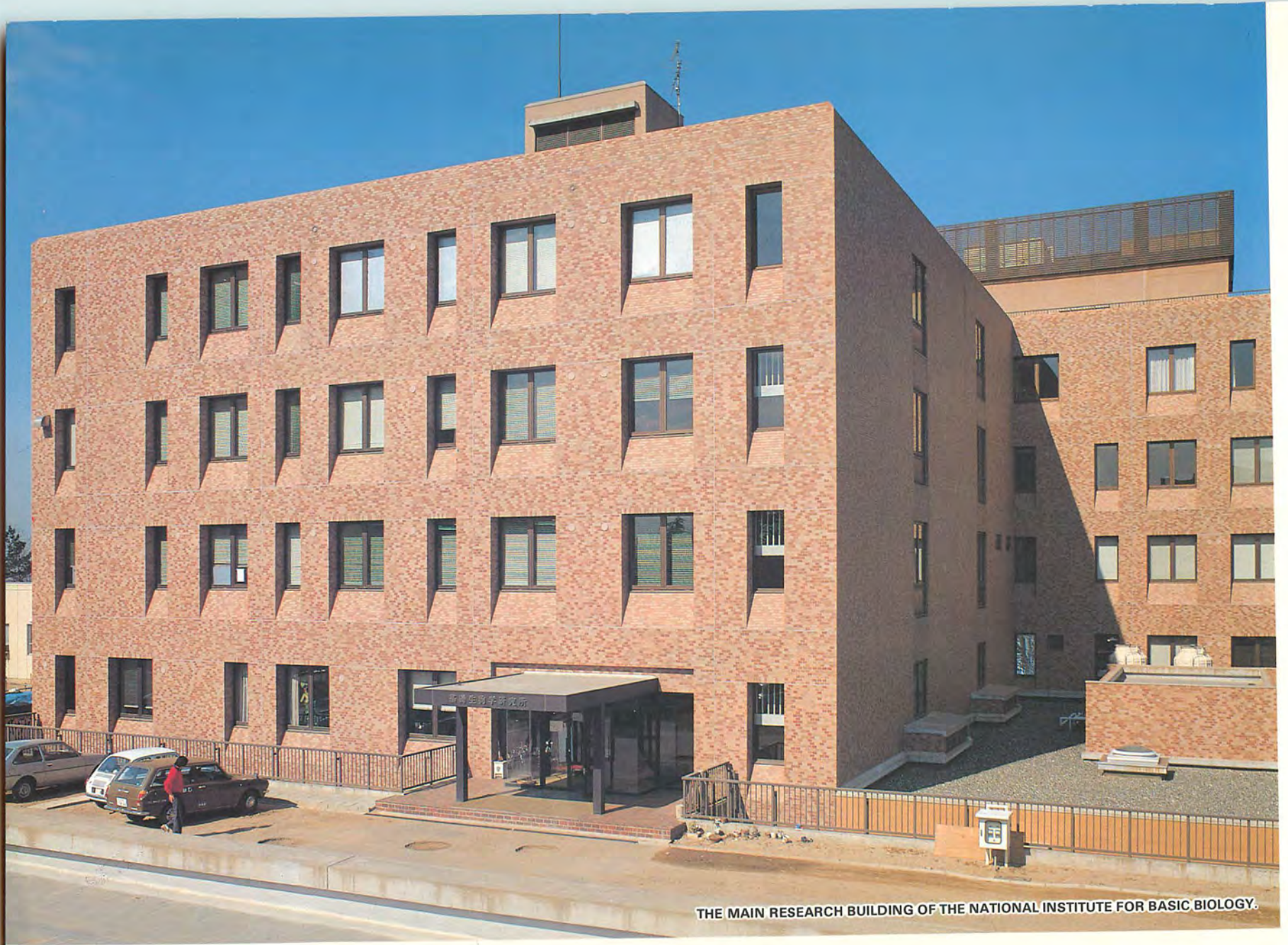
THE MAIN RESEARCH BUILDING OF THE NATIONAL INSTITUTE FOR BASIC BIOLOGY.