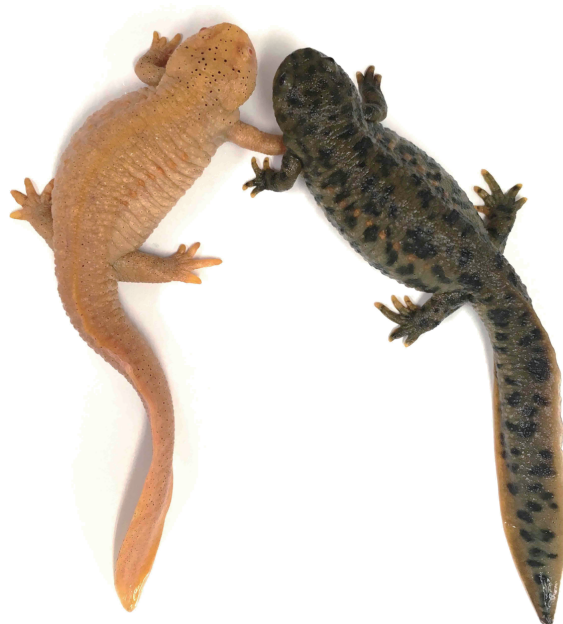
Figure 1. tyrosinase crisant in P. waltl . A knock-out founder of tyrosinase, a melanin synthesis enzyme, and wild newt (left and right, respectively). tyr crisant shows full albinism.