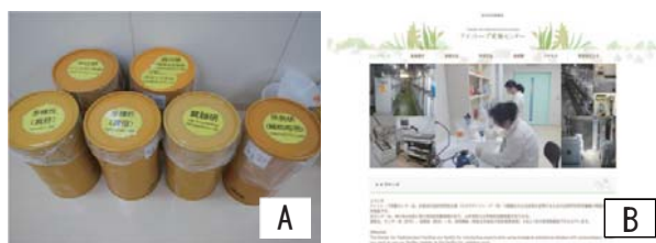
Figure 1. The CRF's notable activities in 2017.

Users and visitors counted by the access control system of the controlled areas numbered 1,302 during this period. The numbers for each area are shown in Table 2. The annual changes of registrants and the number of totals per fiscal year are shown in Figure 2. The balance of radioisotopes received and used at the CRF is shown in Table 3. Yamate area storage radioisotopes were transferred to the storage