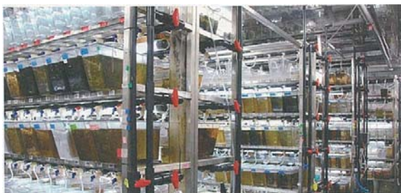
NBRP Medaka fish facility to collect, maintain and supply the five medaka.

Summary of previous accomplishments are as follows. In 2007-2009, we sequenced both ends of 260,000 clones originated from 11 kinds of full-length cDNA libraries and sequenced the whole length of 17,000 independent clones. We also developed strains in which CRE-recombinase can be expressed in any cell lineages using a heat shock promoter, and started to provide strains (TG918, TG921, etc) established using this method. In 2010, we re-sequenced the genomes of five inbred strains by coverage corresponding to genome 100X ( http://medaka.lab.nig.ac.jp/service/menu ). In 2012, we developed a vitrification freezing preserva-