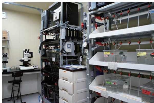
Figure 4. Quarantine room for medaka and zebrafish.

In 2007 NIBB was approved as a core facility of the National BioResource Project (NBRP) for Medaka by the Japanese Government. We have supported the activities of NBRP Medaka by providing standard strains, mutants, transgenic lines and organizing international practical courses for medaka. In 2014 we began providing the CRISPR/Cas9 genome editing platform as well as the TILLING library screening system to promote the reverse genetic approach. In 2015 we shipped 220 independent medaka strains, 155 cDNA/BAC/Fosmid clones, and 195 samples of hatching enzyme to the scientific community worldwide.