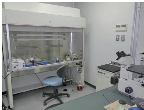
Figure 5. Equipment for tissue and cell culture.

The Cell Biology Research Facility provides various equipment for tissue and cell culture. This laboratory is equipped with safety rooms which satisfy the P2 physical containment level, and is routinely used for DNA recombination experiments.