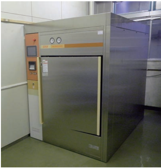
Figure 3. Large sized autoclave in the Myodaiji area.

A new mouse facility in the Myodaiji area opened at the beginning of 2005. The facility provides research-supporting activities to researchers in the Myodaiji area. In March 2009, we expanded the facility which includes areas for breeding, behavioral tests, and transgenic studies using various kinds of recombinant viruses. In 2016 (from January 1 to December 31), 25 mice were brought into the facility in the Myodaiji area, and 1,961 mice (including pups bred in the facility) were taken out.