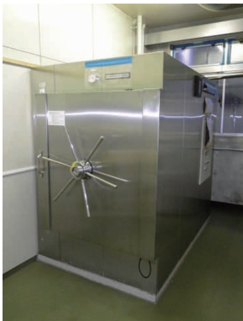
Figure 3. Large sized autoclave in the Myodaiji area.

A new mouse facility in the Myodaiji area opened at the beginning of 2005. The facility provides research-supporting activities to researchers in the Myodaiji area. In March 2009, we expanded the facility which includes areas for breeding, behavioral tests and transgenic studies using various kinds of recombinant viruses. In 2012 (from January 1 to December 31) 9 mice were brought into the facility in the Myodaiji area, and 318 mice (including pups bred in the facility) were taken out.