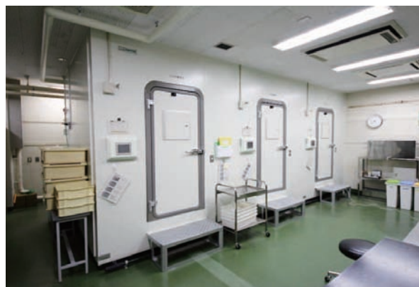
Figure 5. The growth chambers after replacement.

In 2012, the green houses with heating were renovated and installed with weather sensors, and three growth chambers were replaced. The chambers (3.4 m 2 each) can control CO 2 and humidity in addition to temperature and light (max 70,000 lux) conditions.