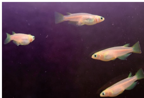
Figure 4. Medaka fish.

In 2007 NIBB was approved as a core facility of the National BioResource Project (NBRP) for Medaka by the Japanese Government. We have supported the activities of NBRP Medaka by providing standard strains, mutants, transgenic lines and organizing international practical courses for medaka. In 2010 we began providing the TILLING library screening system to promote the reverse genetic approach. In 2012 we shipped 175 independent medaka strains, 386 cDNA/BAC/Fosmid clones, and 285 samples of hatching enzyme to the scientific community worldwide.