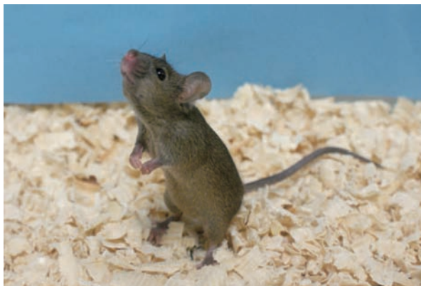
Figure 1. Mouse (strain B6C3F1)

The worldwide genome project has almost been completed and research on basic biology has arrived at a post-genome era in which researchers are focusing on investigating the functions of individual genes. To promote the functional analysis of a gene of interest it is essential to utilize genetically altered model organisms generated using genetic engineering technology, including gene deletion, gene replacement and point mutation.