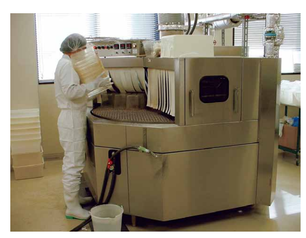
Figure 2. Technical staff washing cages for mice

In 2001, the NIBB mouse facility (built under specific pathogen free (SPF) conditions) opened in the Myodaiji area and the production, breeding, analysis, cryopreservation and storage of genetically manipulated mouse strains has been conducted there since then. The new center facility building in the Yamate area strengthened research activities using genetically altered organisms. The building has five floors and a total floor space of 2,500 m² in which we can generate, breed, store and analyze transgenic, gene targeting and mutant mice under SPF conditions. The mouse housing area was constructed based on a barrier system. This building is also equipped with breeding areas for transgenic small fish, birds and insects.