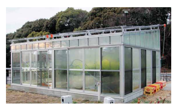
Figure 5. A green house with air-conditioning was built in 2010 and mainly used for cultivation of Lotus japonicus .

Next to the institute building of the Myodaiji area, a 386-m<sup>2</sup> experimental farm is maintained for Japanese morning glory and related Ipomoea species, several carnivorous plants, a pumpkin Cucurbita maxima, and other flowering plants necessary to be cultivated outside. Three green houses (44, 44, and 45 m<sup>2</sup>) with heating are used for the sensitive plant Mimoza pudica, carnivorous plants, and wild-type strains of medaka fish Oryzias sp. Seven green houses (4, 6, 6, 6, 6, 9, and 38 m<sup>2</sup>) with air-conditioning are provided for the cultivation of a rice Oryza sp., Lotus japonica and related legume species, as well as mutant lines of the Japanese morning glory. One green house (18 m<sup>2</sup>) with airconditioning meets the P1P physical containment level and is available for experiments using transgenic plants. The Plant Culture Laboratory also maintains a 46-m<sup>2</sup> building with storage and workspace. Part of the building is used for rearing of the orchid mantis.