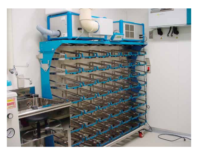
Figure 3. Breeding equipment for mice in transgenic studies using recombinant viruses

A new mouse facility in the Myodaiji area opened at the beginning of 2005. The facility provides research-supporting activities to researchers in the Myodaiji area. In March 2009, we expanded the facility which includes areas for breeding, behavioral tests and transgenic studies using various kinds of recombinant viruses. In 2010 (from January 1 to December 31) 142 mice were brought into the facility in the Myodaiji area, and 2,129 mice (including pups bred in the facility) were taken out.