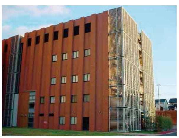
Figure 1. The center facility for transgenic animals in the Yamate area

The worldwide genome project has almost been completed and research on basic biology has arrived at a post-genome era in which researchers are focusing on investigating the