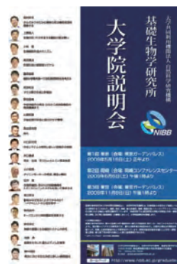
Graduate School Showcase 2009