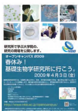
Open Campus 2009