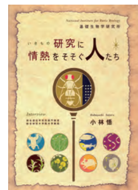
Passionate about Science