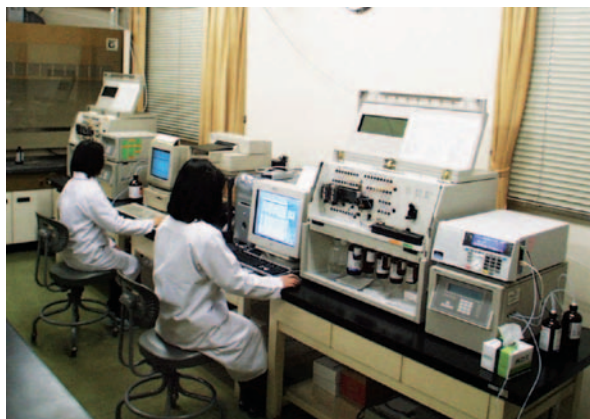
Figure 1. Protein sequencers

High-Resolution Quick Microscope (KEYENCE VH-5000)