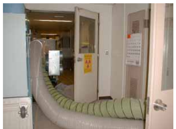
Figure 3. Photograph showing a controlled area during clearing the air supply duct ports