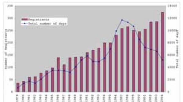
Figure 2. Annual changes of registrants and number of totals per fiscal year