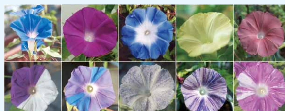
Strains of Japanese morning glory maintained in the center

The National BioResource Project (NBRP) is a national project for the systematic accumulation, storage, and supply of nationally recognized bio-resources (experimental animals and plants, cells, DNA, and other genetic resources), which are widely used as materials in life science research. To promote this national project, NIBB has been appointed as a center for research on Medaka ( Oryzias latipes ) whose usefulness as a vertebrate model was first shown by Japanese researchers. The usability of Medaka as a research material in biology has drawn increasing attention since its full genome sequence recently became available. NIBB is also a sub-center for the NBRP's work with Japanese morning glory. The NIBB BioResource Center has equipment, facilities, and staff to maintain Medaka and Japanese morning glory safely, efficiently, and appropriately. The center also maintains other model organisms, such as mice, zebrafish, Arabidopsis , Lotus japonicus , and Physcomitrella patens , and provides technical support and advice for the appropriate use of these organisms (p. 77).