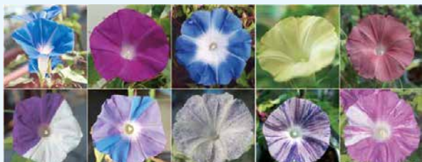
Strains of Japanese morning glory maintained in the center

The National BioResource Project (NBRP) is a national project for the systematic accumulation, storage, and supply of nationally recognized bio-resources (experimental animals and plants, cells, DNA, and other genetic resources), which are widely used as materials in life science research. To promote this national project, NIBB has been appointed as a center for research on Medaka ( Oryzias latipes ) whose usefulness as a vertebrate model was first shown by Japanese researchers. The usability of Medaka as a research material in biology has drawn increasing attention since its full genome sequence recently became available. NIBB is also a sub-center for the NBRP’s work with Japanese morning glory. The NIBB BioResource Center has equipment, facilities, and staff to maintain Medaka and Japanese morning glory safely, efficiently, and appropriately. The center also maintains other model organisms, such as mice, zebrafish, Arabidopsis , Lotus japonicus , and Physcomitrella patens , and provides technical support and advice for the appropriate use of these organisms (p. 80).