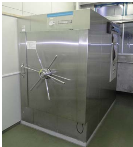
Figure 3. Large sized autoclave in the Myodaiji area.

A new mouse facility in the Myodaiji area opened at the beginning of 2005. The facility provides research-supporting activities to researchers in the Myodaiji area. In March 2009, we expanded the facility which includes areas for breeding, behavioral tests and transgenic studies using various kinds of recombinant viruses. In 2013 (from January 1 to December 31) 612 mice (including pups bred in the facility) were taken out.