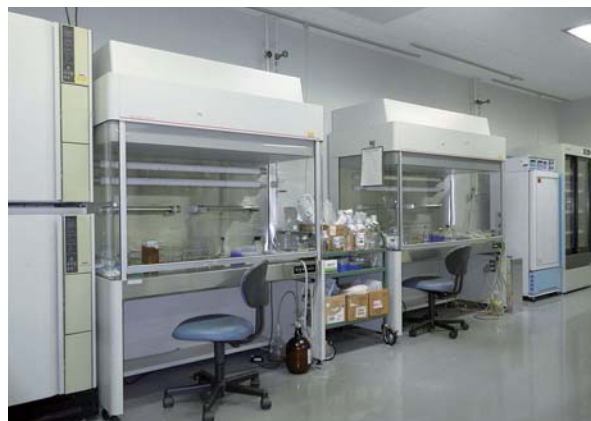
Figure 6. Equipment for tissue and cell culture.