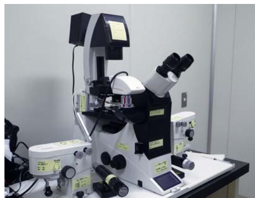
Figure 2. Equipment for manipulating mice eggs.

A number of strains of genetically altered mice from outside the facility were brought into the mouse housing area by microbiological cleaning using in vitro fertilization-embryo transfer techniques, and stored using cryopreservation.