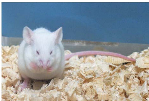
Figure 1. Mouse (strain MCH(ICR))

The NIBB Center for Transgenic Animals and Plants was established in April 1998 to support research using