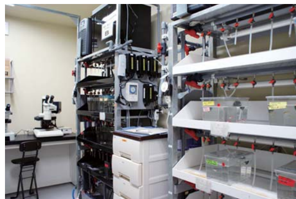
Figure 4. Quarantine room of medaka and zebrafish.

In 2007 NIBB was approved as a core facility of the National BioResource Project (NBRP) for Medaka by the Japanese Government. We have supported the activities of NBRP Medaka by providing standard strains, mutants, transgenic lines and organizing international practical courses for medaka. In 2010 we began providing the TILLING library screening system to promote the reverse genetic approach. In 2013 we shipped 417 independent medaka strains, 197 cDNA/BAC/Fosmid clones, and 165 samples of hatching enzyme to the scientific community worldwide.