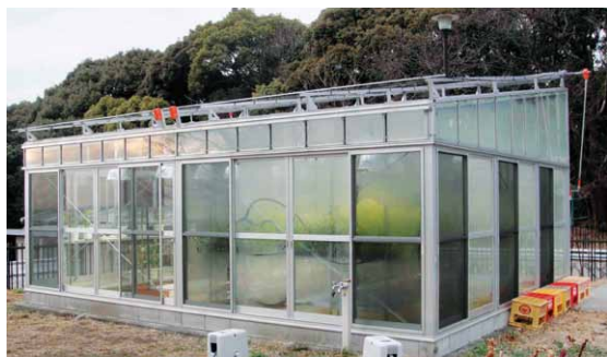
Figure 5. A green house with air-conditioning was built in 2010 and mainly used for cultivation of Lotus japonicus .

Next to the institute building of the Myodaiji area, a 386-m 2 experimental farm is maintained for Japanese morning glory and related Ipomoea species, several carnivorous plants, a pumpkin Cucurbita maxima , and other flowering plants necessary to be cultivated outside. Three green houses (44, 44, and 45 m 2 ) with heating are used for the sensitive plant Mimosa pudica , carnivorous plants, and wild-type strains of medaka fish Oryzias sp. Seven green houses (4, 6, 6, 6, 6, 9, and 38 m 2 ) with air-conditioning are provided for the cultivation of a rice Oryza sp., Lotus japonica and related legume species, as well as mutant lines of the Japanese morning glory. One green house (18 m 2 ) with air-conditioning meets the P1P physical containment level and is available for experiments using transgenic plants. The Plant Culture Laboratory also maintains a 46-m 2 building with storage and workspace. Part of the building is used for rearing of the orchid mantis.