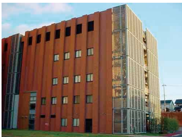
Figure 1. The center facility for transgenic animals in the Yamate area

The worldwide genome project has almost been completed and research on basic biology has arrived at a post-genome era in which researchers are focusing on investigating the