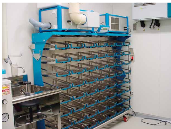
Figure 3. Breeding equipment for mice in transgenic studies using recombinant viruses

A new mouse facility in the Myodaiji area opened at the beginning of 2005. The facility provides research-supporting activities to researchers in the Myodaiji area. In March 2009, we expanded the facility which includes areas for breeding, behavioral tests and transgenic studies using various kinds of recombinant viruses. In 2010 (from January 1 to December 31) 142 mice were brought into the facility in the Myodaiji area, and 2,129 mice (including pups bred in the facility) were taken out.