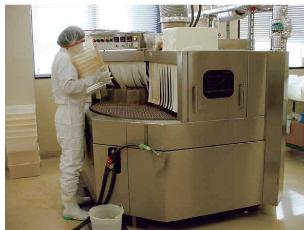
Figure 2. Technical staff washing cages for mice

In 2001, the NIBB mouse facility (built under specific pathogen free (SPF) conditions) opened in the Myodaiji area and the production, breeding, analysis, cryopreservation and storage of genetically manipulated mouse strains has been conducted there since then. The new center facility building in the Yamate area strengthened research activities using genetically altered organisms. The building has five floors and a total floor space of 2,500 m 2 in which we can generate, breed, store and analyze transgenic, gene targeting and mutant mice under SPF conditions. The mouse housing area was constructed based on a barrier system. This building is also equipped with breeding areas for transgenic small fish, birds and insects.