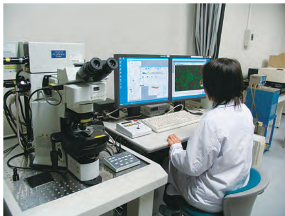
Figure 2. Confocal Laser Scanning Microscope