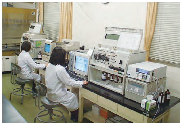
Figure 1. Protein sequencers